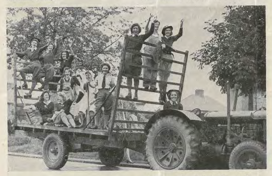
Prize winners in the Victory Procession at Watford, Herts.

Children playing with matches recently set fire to wheat stacked in a Dutch barn. A strong wind was blowing and the fire spread to adjoining ricks. The result was: Destroyed —60 tons of wheat. 40 tons of oats, 50 tons of hay, 100 tons of baled straw, 45 tons of beans, 4 field gates and 2 tons of wooden boards 8 feet long. Damaged —100 tons of mangolds, 20 tons of beet and one fireman who was burnt on both feet.