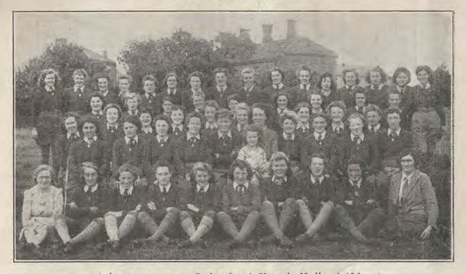
A happy group at Swineshead Hostel, Holland (Lincs.)

claimed to be the largest field in North Wales, The Dance in aid of the County "Benevolent Fund," held in the Beach Pavilion, Prestatyn, on